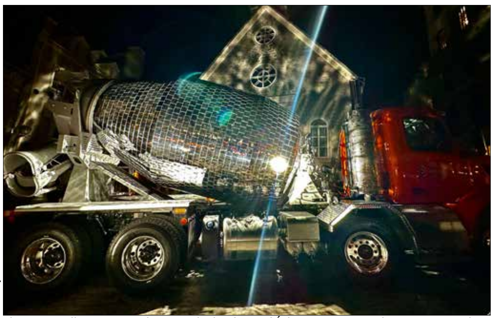
The Disco Ball Cement Truck was parked in front of Église Notre-Dame-des-Victoires in Place Royale.